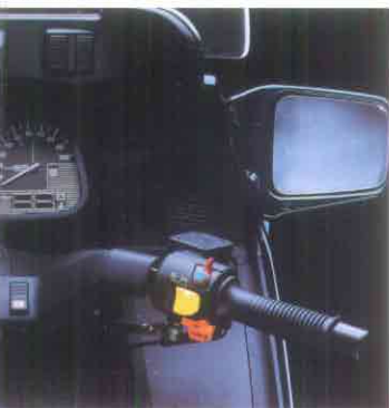
use the true test of a touring machine isn't how comfortable a trip coming back.

Which is why we've created a special, rigid, lattice frame that shares weight bearing with the engine. An innovative design that helps make both a lighter motorcycle, and a considerably stronger one.