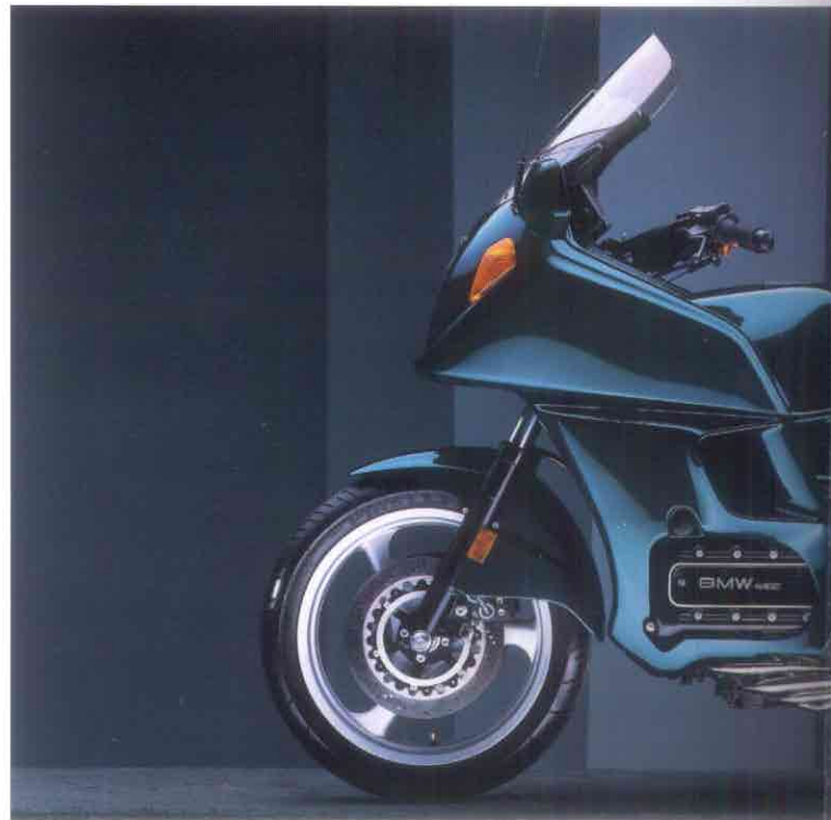
The revolutionary 1100cc engine, tuned for ample torque, ensures supremely confident sporting performance and acceleration.

It all sounds like science fiction. But it's really just motorcycle science at its finest.