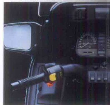
The K1100LT provides ample space for both rider and passenger. Because it makes the trip going across country. It's how comfortable it makes the

This little feat of engineering helps provide less brake stutter, improved traction through acceleration, smaller load change responses and better road holding through all the