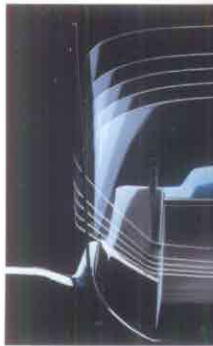
Our electronic windshield adjusts automatically for the finest luxury cars.

And thanks to a new BMW piston design, engine vibration has virtually vanished.